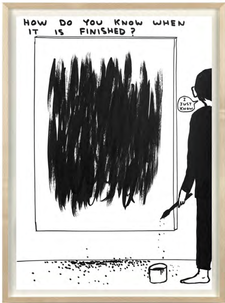
David Shrigley. Untitled . From "Lockdown Drawings." 2020, ink on paper, Stephen Friedman Gallery.