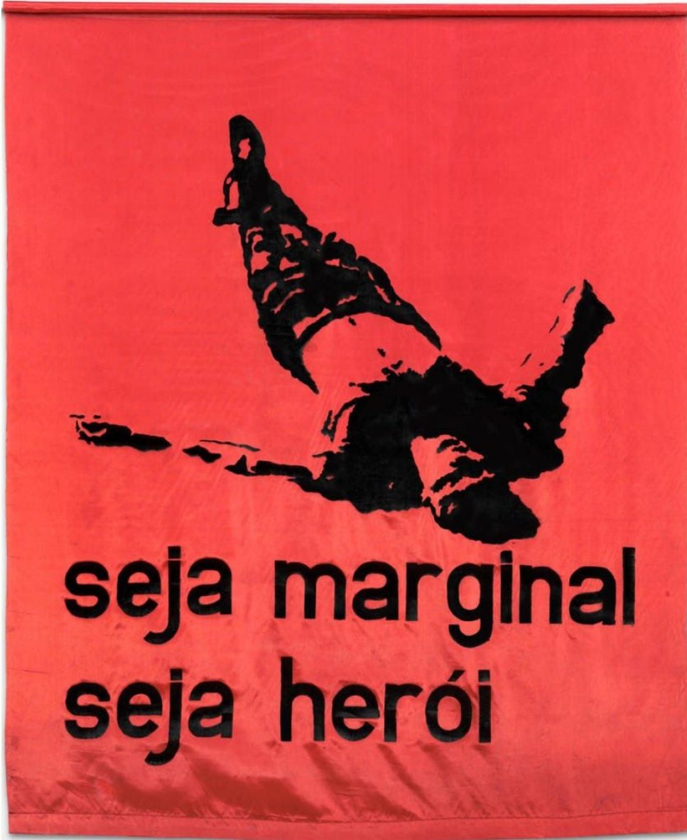
Hélio Oiticica, "Be an Outlaw, Be a Hero," 1967

Friday, January 22nd | 4:00–6:00 pm | Via Zoom